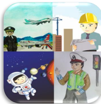
Figure 2. The main display of professional gaming applications under the name "Professional Game for Early Childhood Education"

The opening screen is the main opening menu of the media which is named "Professional Game for Early Childhood". This menu is the main view menu of profession-based games android. This menu consists of the iconic main display of professional gaming apps represented by pilot professions, architects, police, and astronauts.