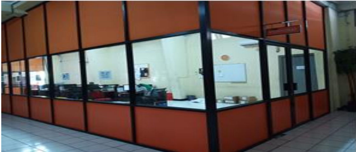
Fig. 1. Open Employee Workspace

The open arrangement of the space gives the advantage of the open layout of the room that looks big because there is no visible hallway blocking the circulation path from employee mobility. In addition, open layout can minimize the cost of using material for insulation. Another advantage of open layout is that it makes it easier to rearrange your furniture needs if you have to dismantle it and adjust it to work needs. This layout form is suitable for jobs where employees do not require high concentration because the noise between cubicals has the potential to disturb, compared to the sound that works is blocked by walls.