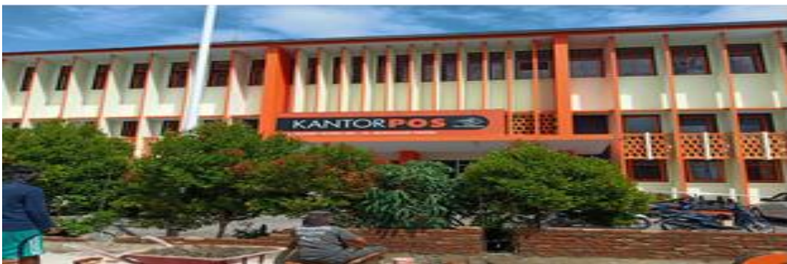
Fig. 2. Orange as The typical Color of Post Office

To create a concept for a PT.Pos office, no matter where the branch is, they will use the same type of color, shape of furniture and materials as well. This standardization is usually done to provide a corporate identity for the offices that have branches. PT.Pos uses the characteristic orange color in all of its office designs and layouts.