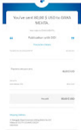
PAY PAL IJSDR.jpg 33K